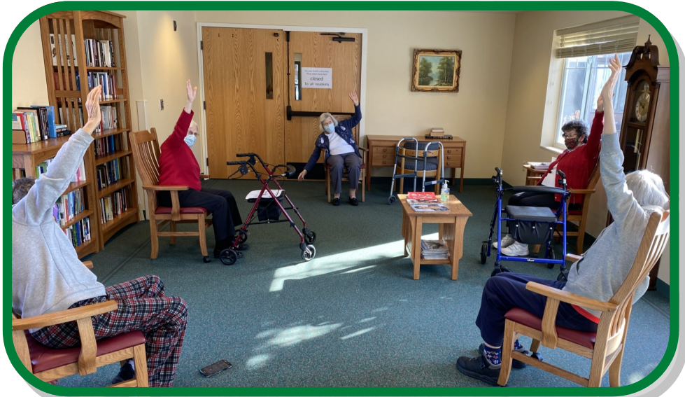
Exercise in the Apartments