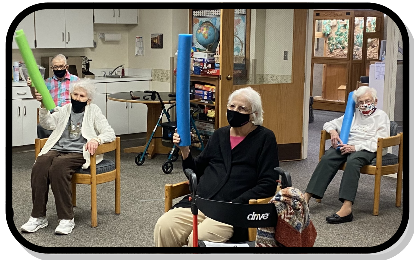
Pool Noodle Exercise