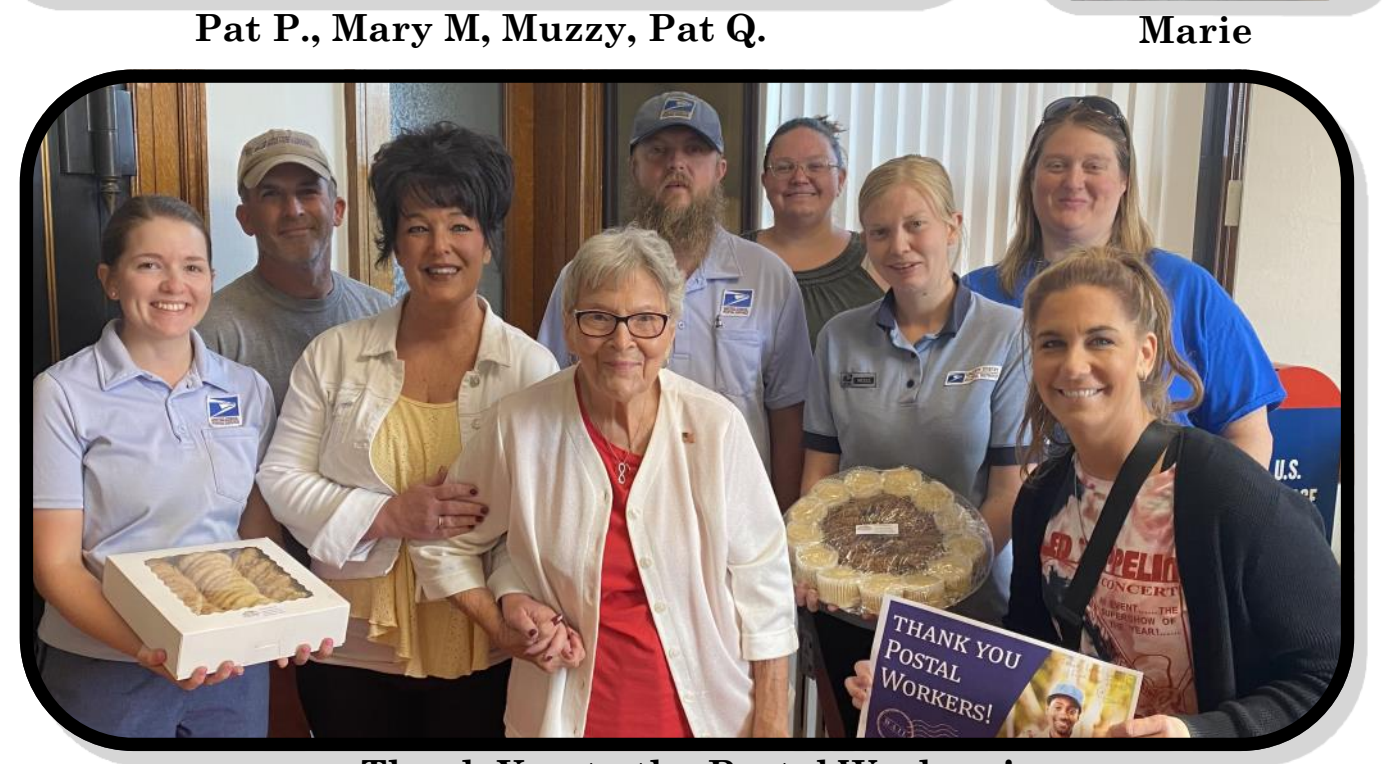
Thank You to the Postal Workers!