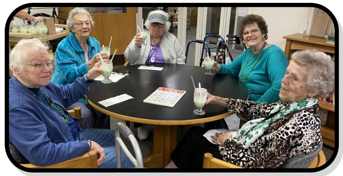
St. Patrick's Day Party