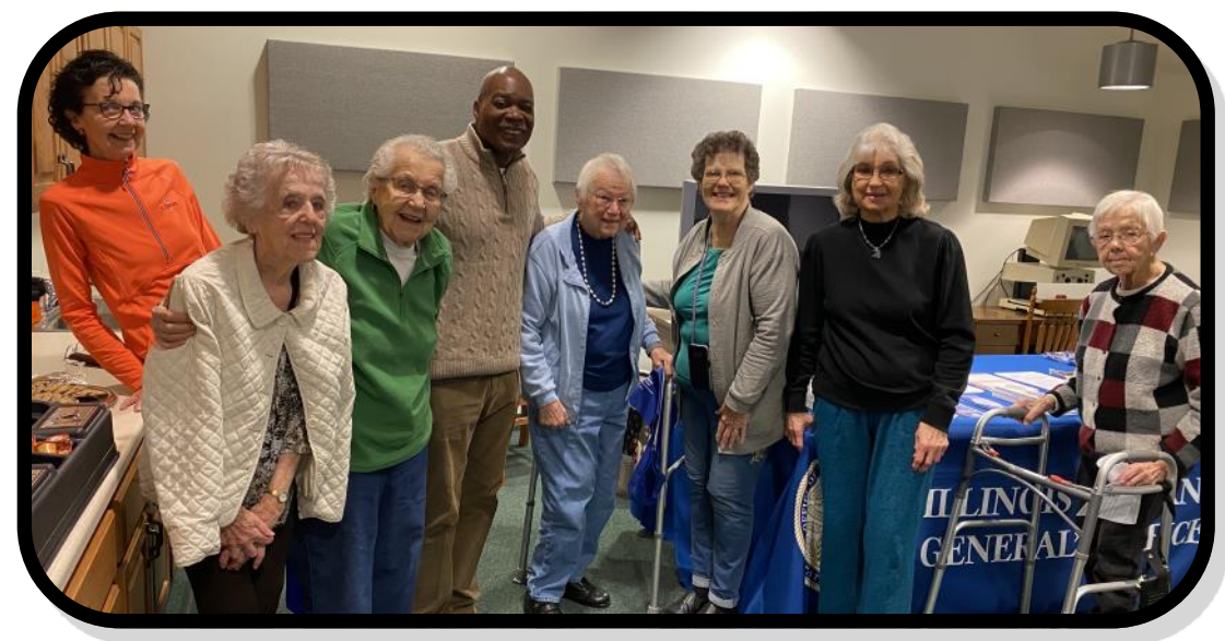
Group Meeting with Attorney General Representative